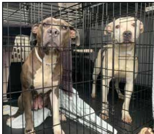
Thirty-one pets from tornado-torn Alabama traveled 17 hours to safety at MHHS.