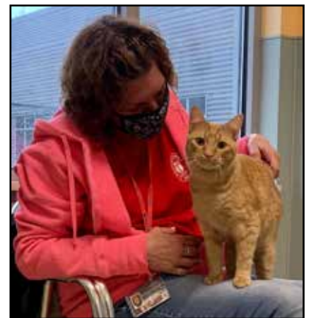
Handsome Buddy meets his new mom.