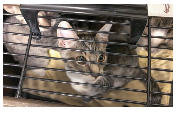
MHHS took in 31 cats evacuated from South Carolina during Hurricane Dorian.

couldn't even visit with her. Based on her story and knowing they could give her the time she needed, they knew they couldn't leave without her.