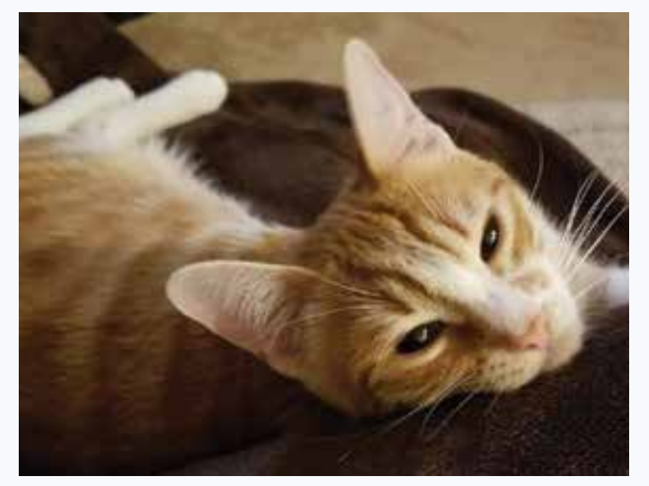
An update on Pixie! It took a little time, but she's feeling right at home now.