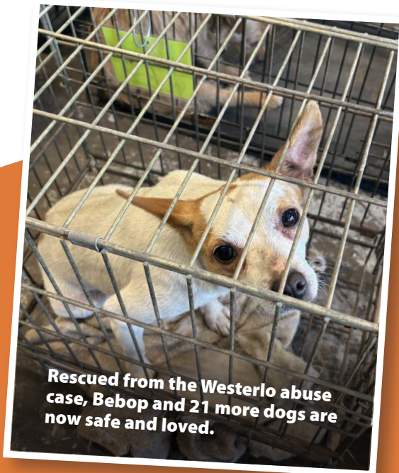
Rescued from the Westerlo abuse case, Bebop and 21 more dogs are now safe and loved.

Binkie arrived in rough condition. He was severely matted, dirty, and limping. During his neuter surgery, our veterinarian discovered his hip was dislocated. With skill and care, she was able to place it back into position, giving Binkie not just relief but a real chance at mobility and comfort. He then stepped into a new life with a loving family.