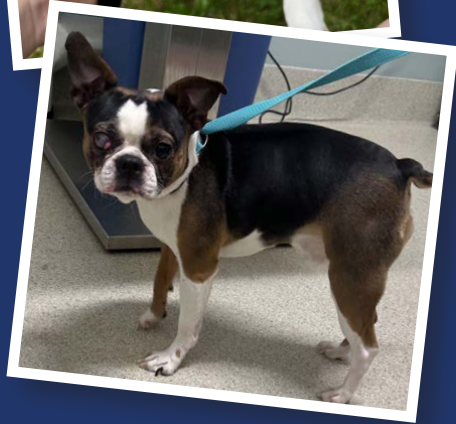
Opie's painful eye condition is gone, replaced by a happy, playful smile.